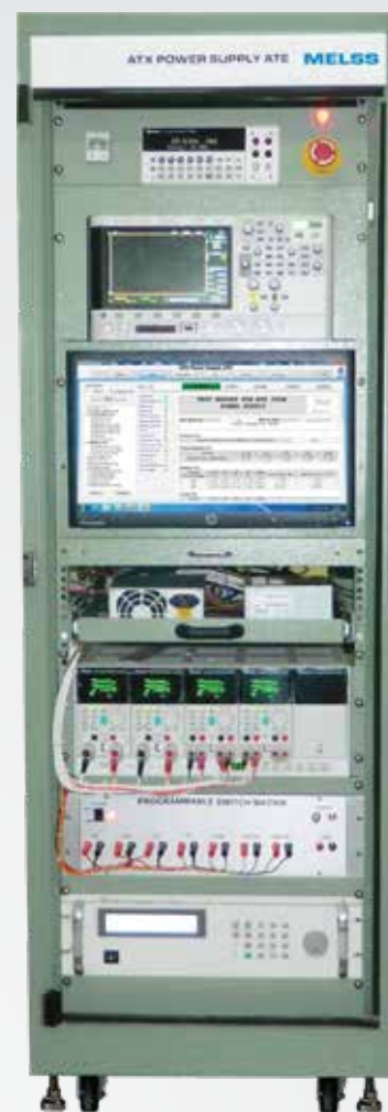
ATX Power Supply ATE

Solder Paste, Wire and Flux | Cleaning Chemicals | ESD Workstation Monitors SMT / BGA Rework Station | PCB Assembly & Bench Tools | Dispensing Systems Memory Programmers | Test Probes and Receptacles | Power Supply & Test Products Component Testers | General T&M Products | ATE / Functional Testers EMC Test Products | Reliability Testers